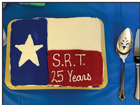
25th Anniversary Cake